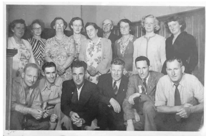
Blockhouse Bay founding Committee

This record should be seen as a continuous work in progress!