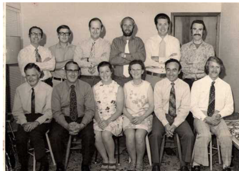
Green Bay / Titirangi Founding Committee